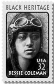
Issued in 1995

After her death, the U.S. Post Office issued a stamp in her honor and a Chicago street was named after her. May 2nd has been declared Bessie Coleman Day in Chicago.