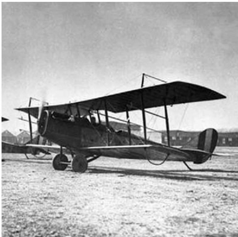
Curtiss Jenny airplane

At first, Bessie had to borrow a plane for her shows. In time, Bessie had enough money to buy her own plane, a Curtiss Jenny . Shortly after she bought the plane, its engine jammed, and she crashed. Bessie had a broken leg, broken ribs, and numerous cuts. She was in the hospital for three months. As soon as she was released, Bessie went right back to flying.