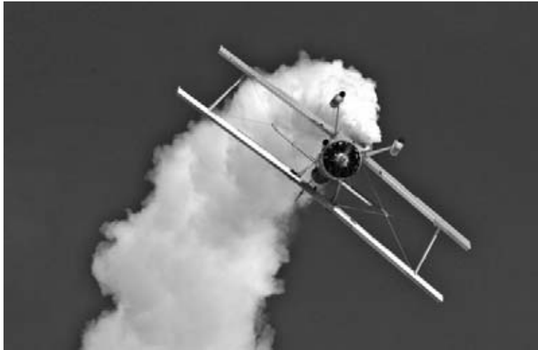
A plane performs a stunt at a modern air show.