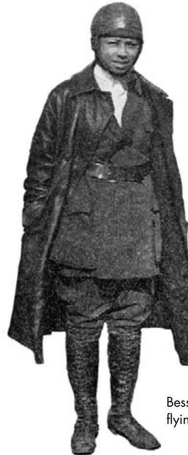
Bessie in her flying suit

Bessie's dreams did not end with becoming a pilot. She wanted to start a flying school for others, especially African-Americans. But she would need money to start the school, and the best way for a pilot to make money was to perform at air shows.