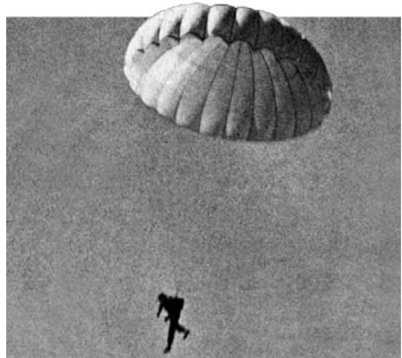
Bessie used early versions of parachutes like this one when jumping from planes.

Bessie took other steps to help put an end to discrimination. She insisted that everyone, blacks and whites, males and females, should be allowed to attend any of the events in which she participated. She would not give a show or a speech to a white-only crowd.