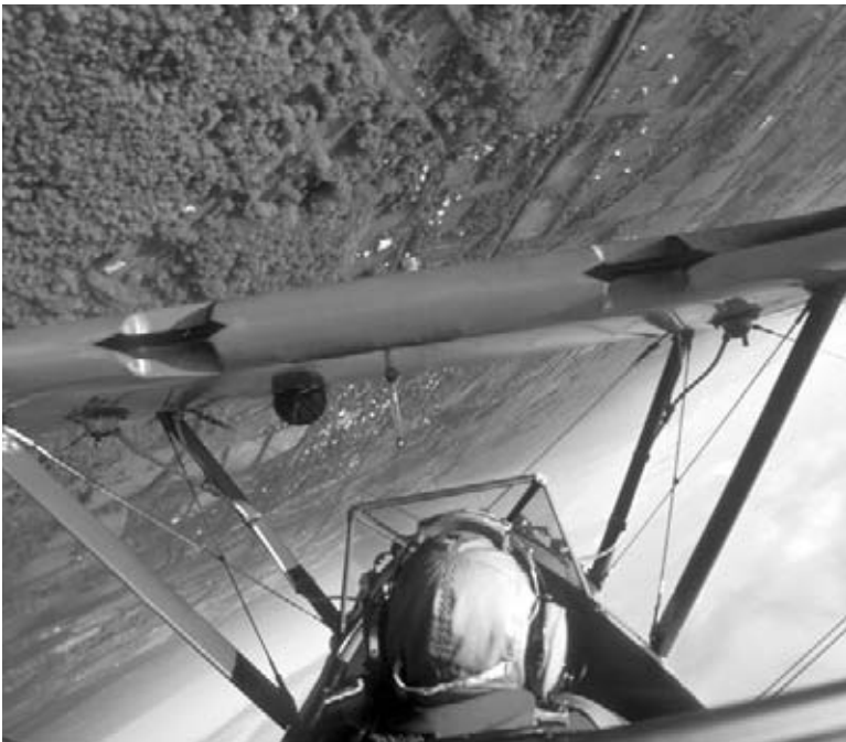
A pilot's view in a loop-the-loop stunt

Bessie's act pleased crowds wherever she performed. One of her stunts was the loop-the-loop , where Bessie would fly her plane straight up in the air, turn upside down, and make large loops in the sky.