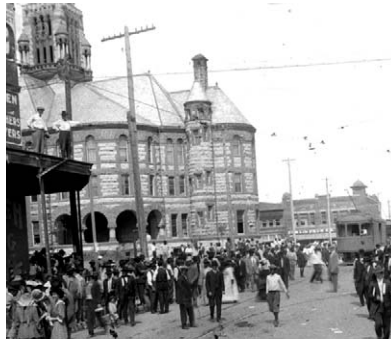
Waxahachie courthouse between 1911 and 1919