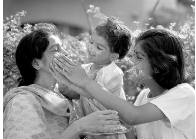
Family members decorate each other during Holi.