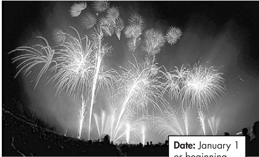
Fireworks are part of many New Years celebrations.