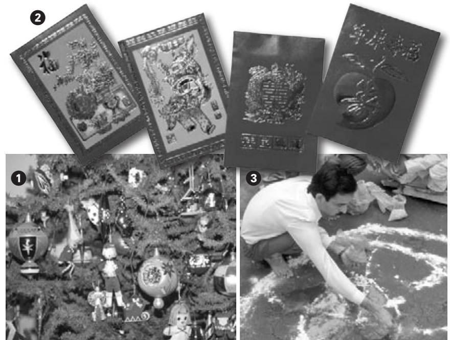
❶ Ornaments decorate a tree during Christmas ❷ Gift envelopes used during Chinese New Year ❸ Painting the ground bright colors during Holi

People all over the world celebrate holidays that are full of traditions . Traditions are the special ways people do something. People celebrate holidays by preparing and eating food, playing games, singing songs, and telling stories.