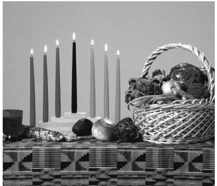
The Kwanzaa table includes vegetables placed on an mkeka, or mat.

During Kwanzaa, people celebrate by eating together and giving gifts. A mkeka , or mat, with vegetables is put in the home. Special items are placed on this mat. People tell traditional stories with family and friends.