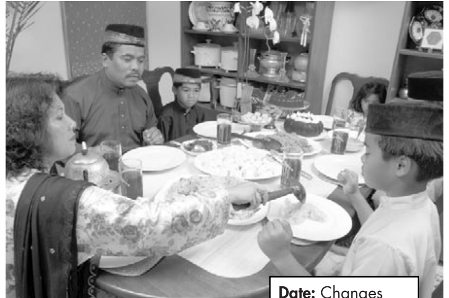
A family eating together at the end of Ramadan.

People all over the world celebrate the New Year. People use different calendars to tell when a new year starts. They have many traditions. Many people celebrate with fireworks and songs. They may toss colorful pieces of paper in the air. People also might wish each other good luck for the new year.