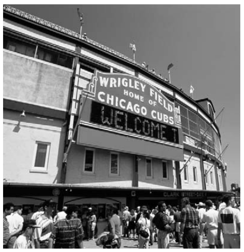
Wrigley Field, where the Chicago Cubs play home games

People loved it and started buying it. He became so rich from gum sales, he was able to buy a professional baseball team, the Chicago Cubs. He also built a stadium for them, Wrigley Field. Then, he bought an island off the coast of Southern California, Catalina Island, where he could relax and enjoy himself.