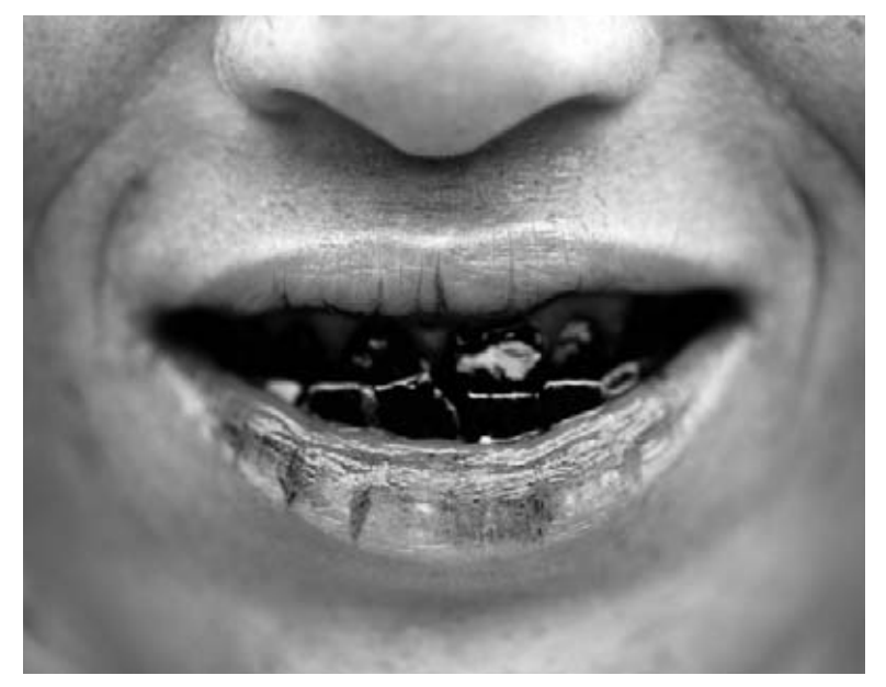
Chewing betel nuts and leaves stains the teeth red.

People from Greece chewed mastiche . Native peoples from South America chewed chicle . In India, betel was popular.