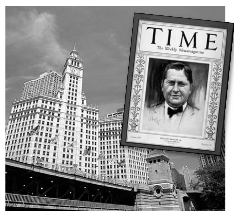
The Wrigley Building in downtown Chicago was named after the Wrigley family.