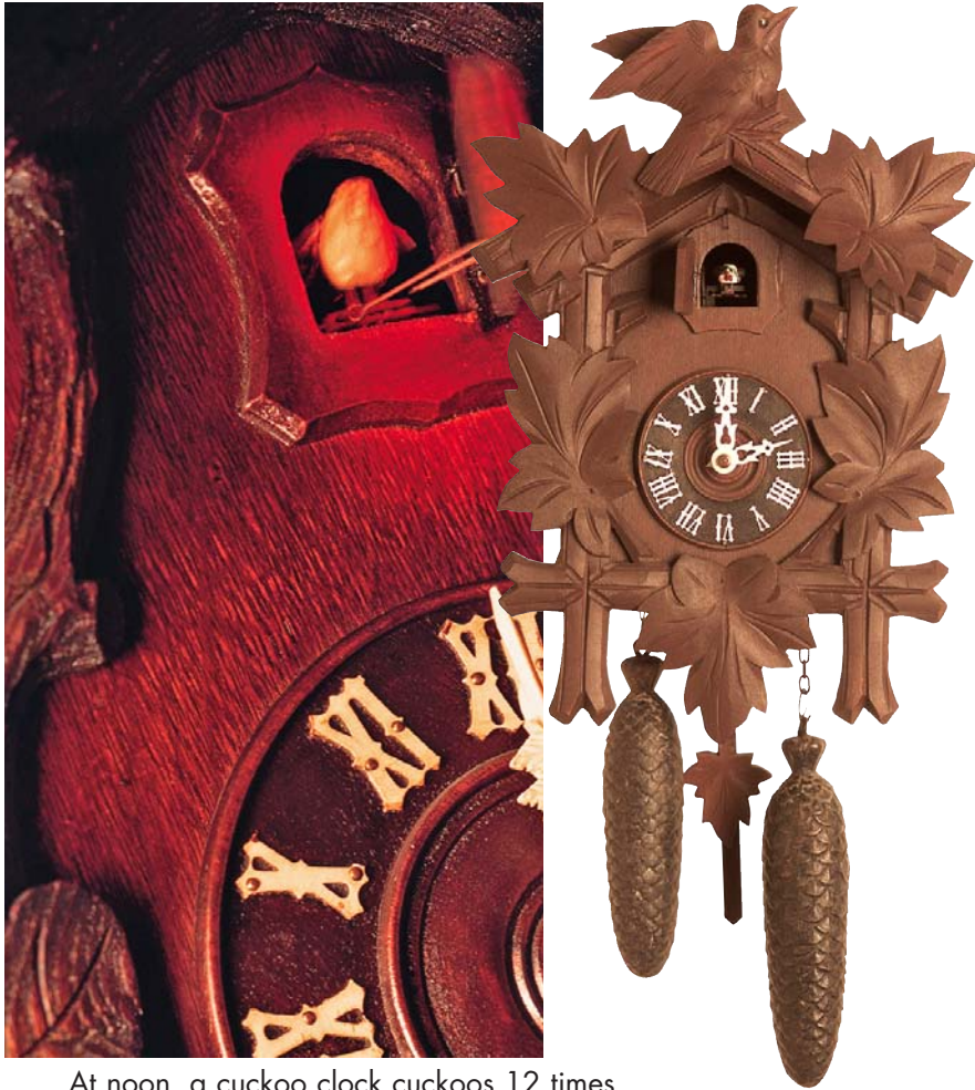
At noon, a cuckoo clock cuckoos 12 times.

Inside one kind of analog clock is a carved bird called a cuckoo . Every hour, the door opens and the bird pops out and sings its song: cuckoo, cuckoo, cuckoo!