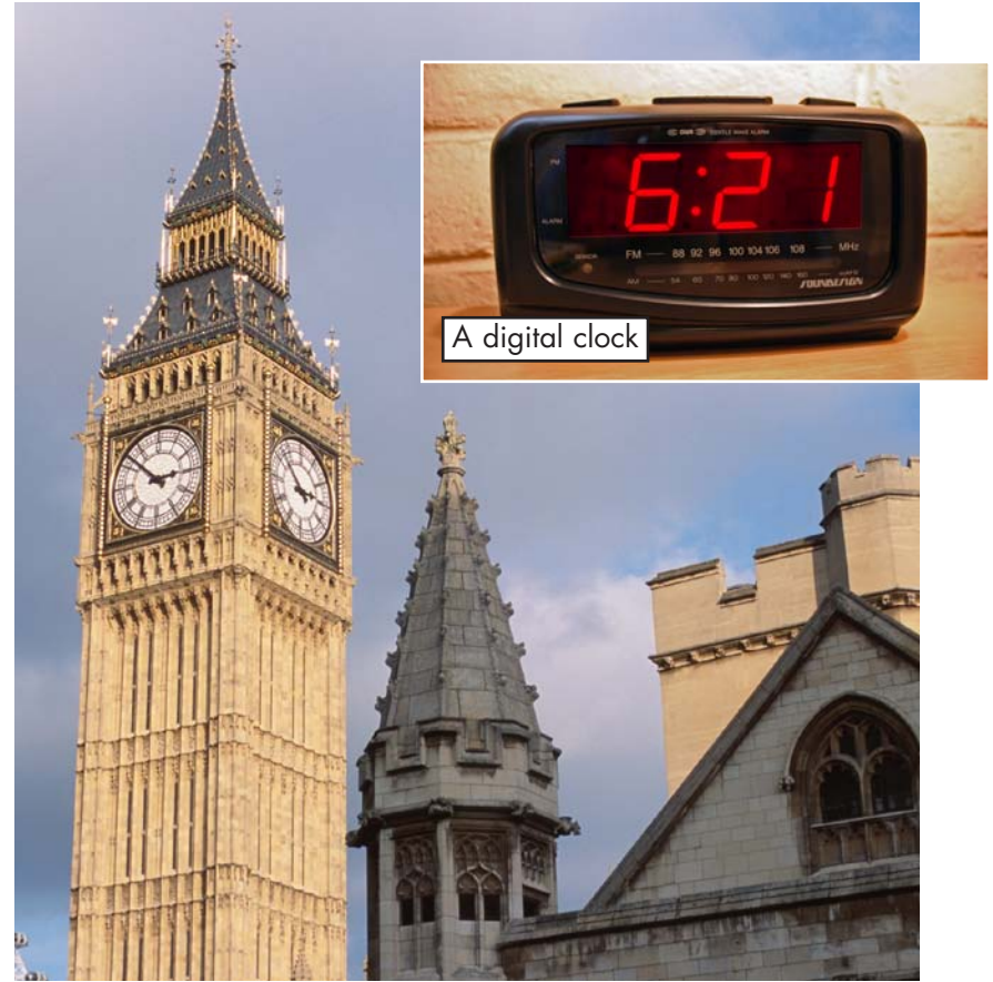
Big Ben, an analog clock tower in London, England

Now there are all kinds of timepieces, from tall grandfather clocks to watches we wear on our wrists. Most clocks run on electricity from batteries.